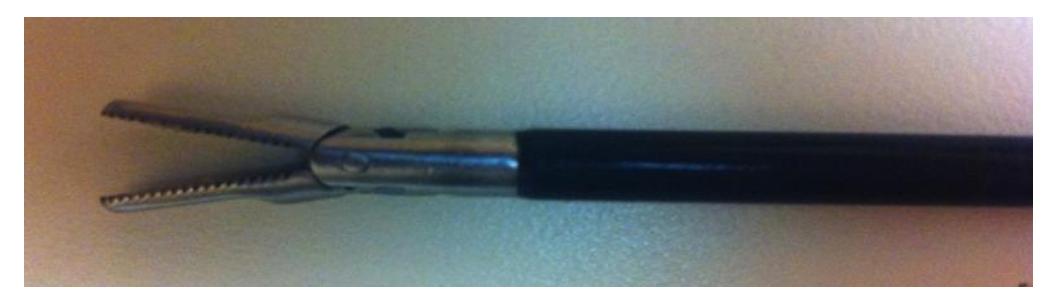
Figure 3: Region of attachment for marking device.

The majority of laparoscopic surgeries utilize 5 mm diameter instruments, with trocar ports that allow for ~1 mm of marker space around the shaft of the instrument. Given that, it will be necessary to design the accessory device less than 1 mm thick so that it can easily slide through the port. Lastly, the design needs to be made under a budget of $200.