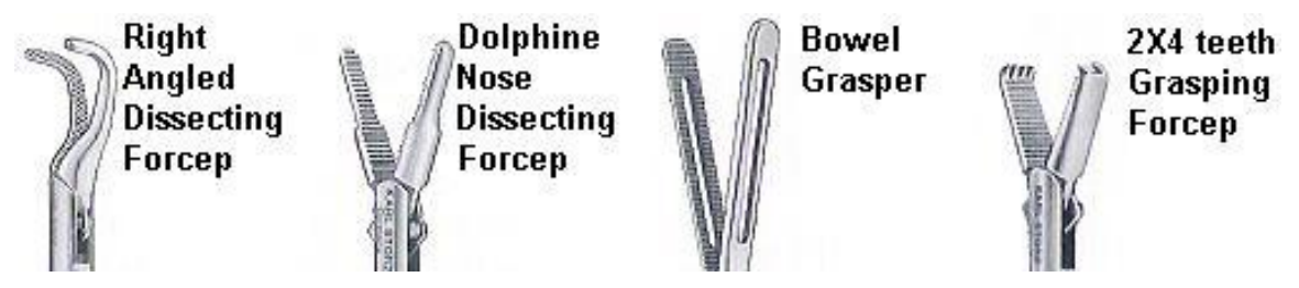
Figure 2: Variety of tip shapes and sizes used in laparoscopic surgeries

There is currently no other competition on the market for this type of accessory device.