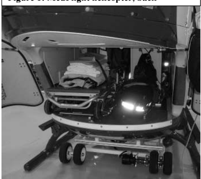
Figure 1: MedFlight helicopter, back

This is where the stretcher is loaded into the helicopter. There is some storage space on the right, but it would not be accessible during flight.