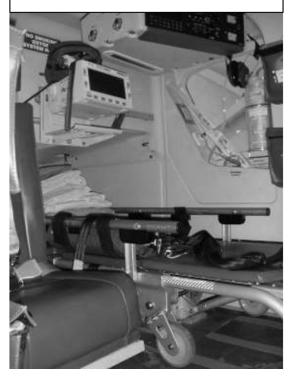
Figure 2: MedFlight helicopter, front

This is where the doctor and flight nurse work on the patient. The patient is accessible from the hips up. The saline bag is hung next to the monitor (top left).