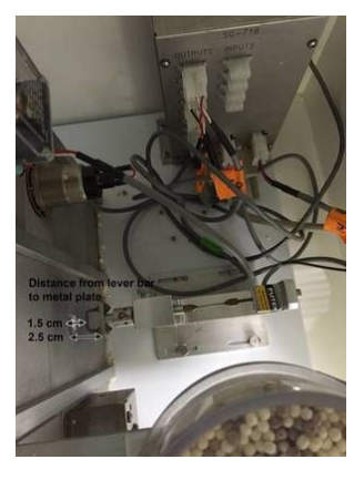
Figure 1: Picture of current system, handlebar will be 2.5 cm from the slot in the cage wall