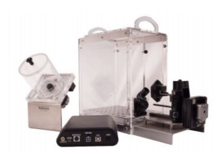
Figure 1 - Vulintus Mototrack: This is the Vulintinus Mototrack with the cage, controller, and pellet dispenser.

The current device is known as the Vulintus Mototrack seen in Figure 1. The research team at Temple University currently runs its investigations using it. The Mototrak is a complete system that includes a cage, controller, behavior module, pellet dispenser, auto positioner, and the MotoTrak software. Utilizing this system rats were trained and data was collected to determine the average reach force and the average reach duration.