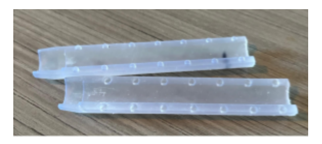
Figure 1: Image of 3D printed coring device opened to allow tissue to be removed.

The team's coring device was 3D printed in FormLabs BioMed Clear Medical Resin. This is a rigid, USP Class VI certified