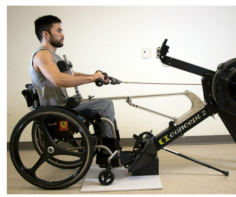
Figure 1. AROW Rowing Machine [5]