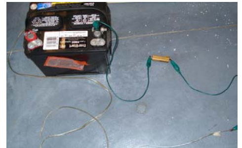
Figure 6: Circuit

Standard wires complete a simple circuit consisting of the battery, a 2 ohm power resistor, and a fan motor connected in series ( Figure 6 ). The power resistor decreases the power reaching the motor and is necessary to slow the rotational velocity. The 2 ohm power resistor can be