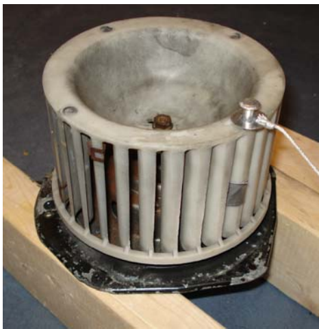
Figure 7: Fan Motor

The fan motor is salvaged from the heater blower of a car. Any other motor that provides a similar circular rotation would also work, as long as it is able to pull on the diaphragm with enough force. A bolt and washer is glued, tied, and/or taped through the outer rim of the fan that is attached to the gear of the motor ( Figure 7 ). Tied to the washer is an approximately 70 cm long string. The washer allows free rotation and prevents the string from coiling up and breaking.