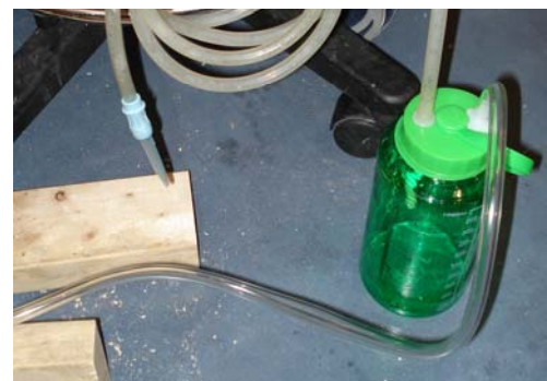
Figure 9: Collection Chamber, Tubing, and Autoclavable Tip

Left: diaphragm; Right: green output valve, black inlet valve