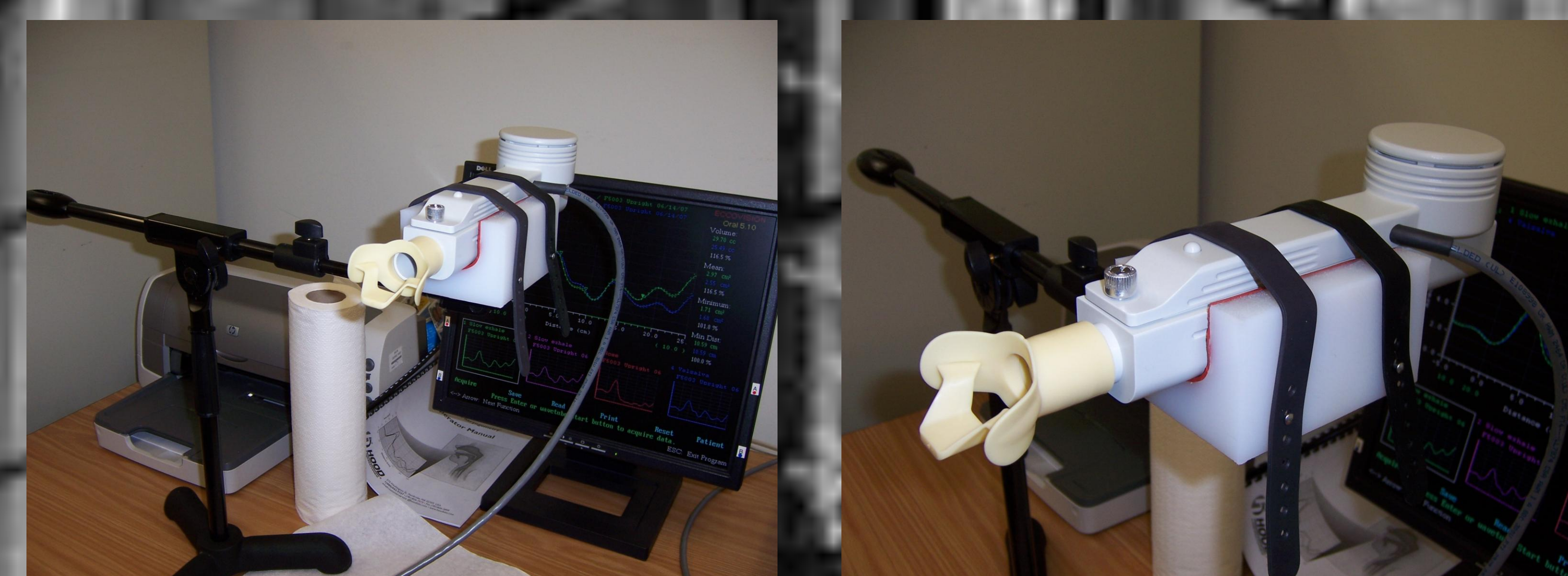
The adjustable wave tube stand in the laboratory setting at the University of Wisconsin Vocal Tract Lab