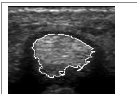
Figure 1. Clipping algorithm output.