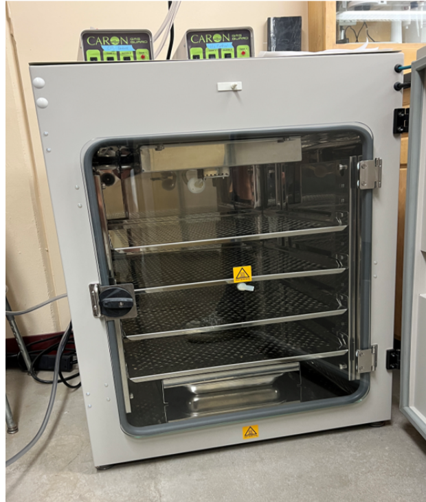
Figure 3: The Henak lab's incubator, inside which the bioreactor will be housed.

As this incubator will require electronics, it will be necessary to access power sources from inside the incubator. There are several ports in the incubator that allow this, but care must be taken to ensure that all cables may fit through the limited space. It will also be crucial that the entire bioreactor fits inside the incubator, which has internal dimensions of 21x20x25 in.