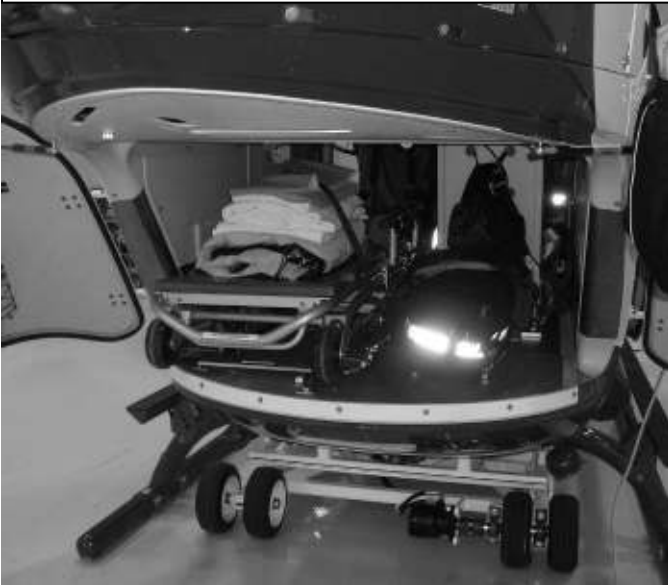
Figure 1: MedFlight helicopter, back

This is where the stretcher is loaded into the helicopter. There is some storage space on the right, but it would not be accessible during flight.