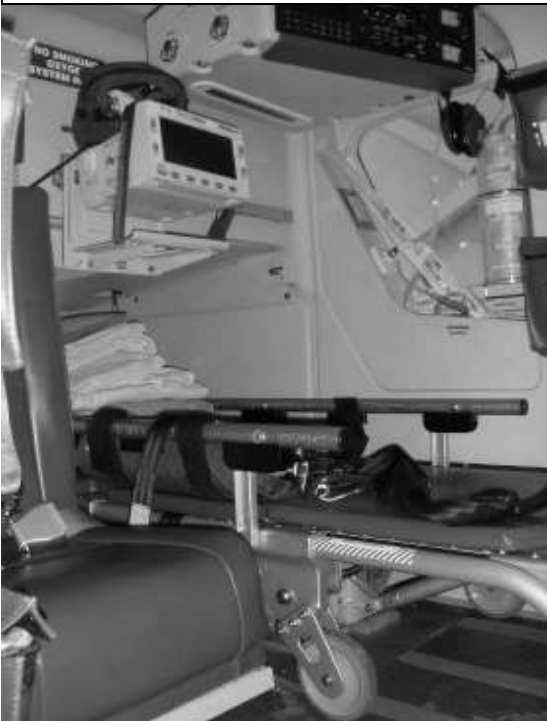
Figure 2: MedFlight helicopter, front

This is where the doctor and flight nurse work on the patient. The patient is accessible from the hips up. The saline bag is hung next to the monitor (top left).