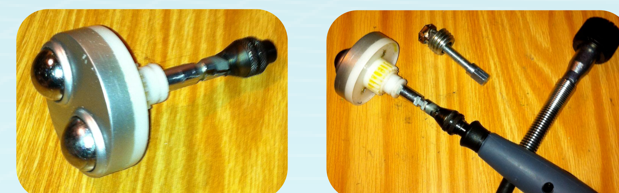
Figure 4. The rotating massaging component (left) and the massager attached to the Dremel shaft (right)