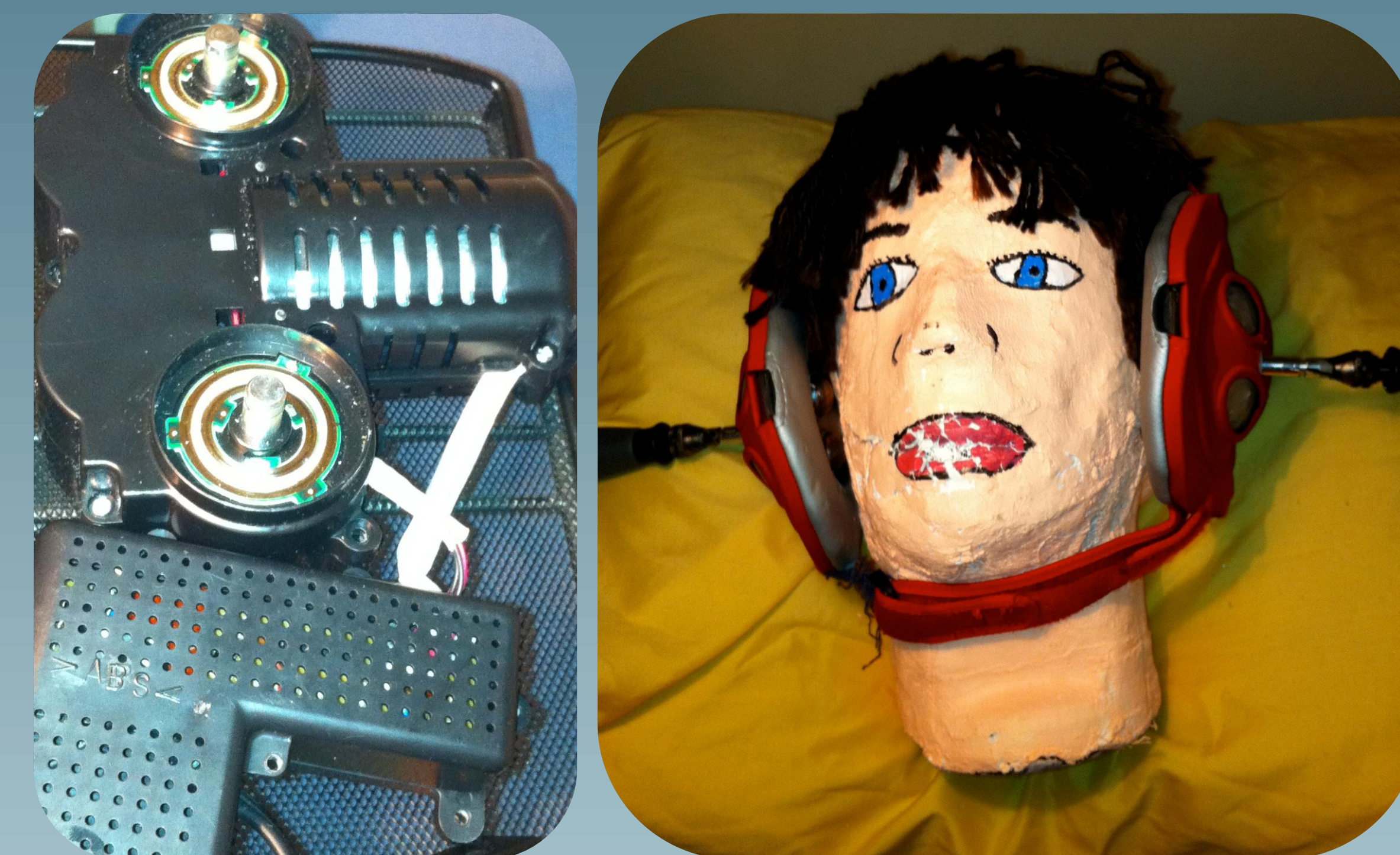
Figure 2. Final prototype (Clockwise from top left): headgear with Dremel attachments; Dremel flexible shaft; device with Dremel shafts attached; motor and electrical controller