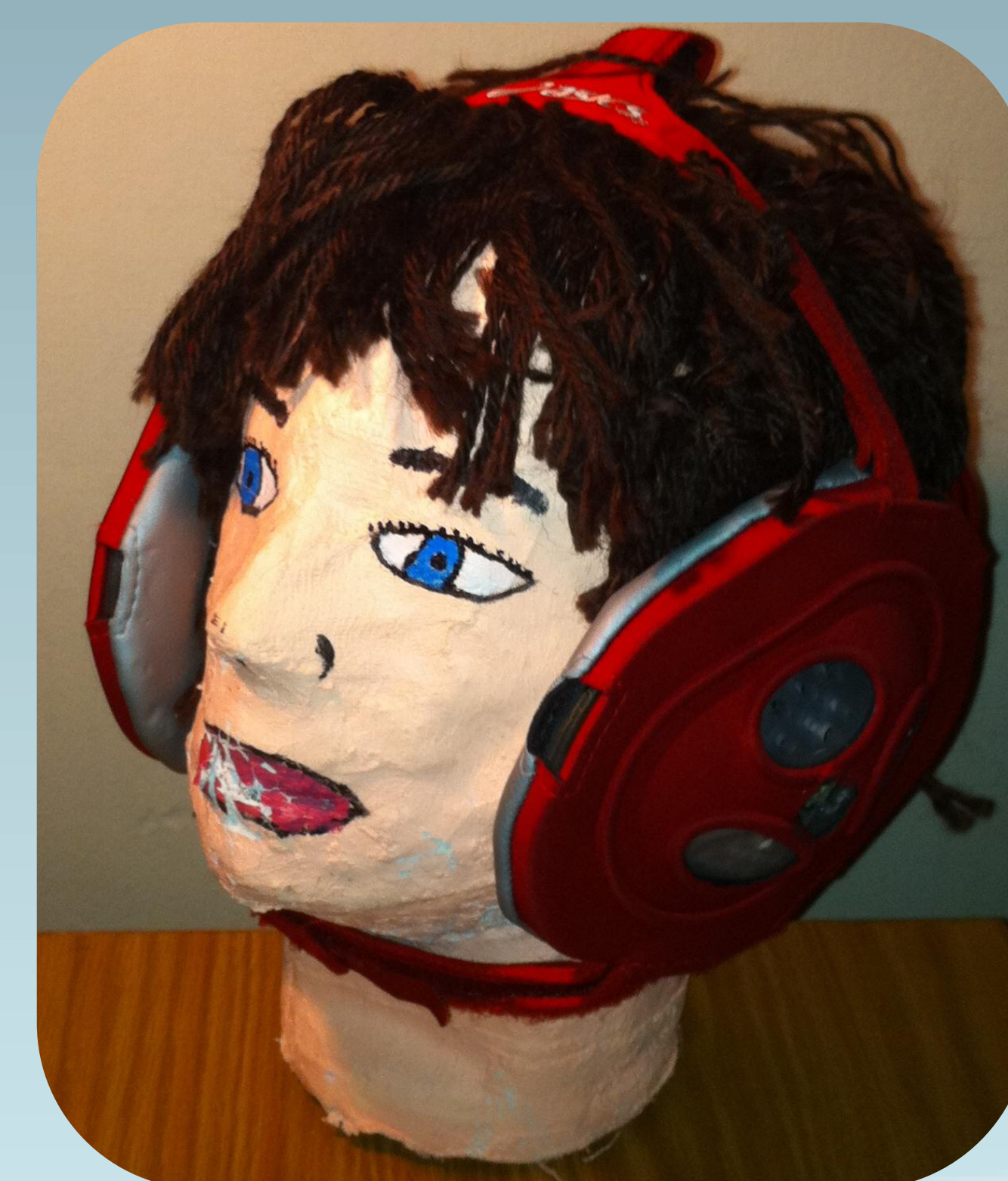
Figure 3. Headgear with holes on the sides for different strap placement and center hole for massaging device