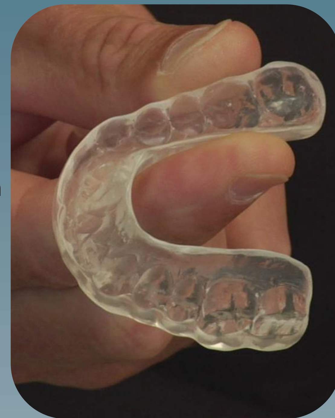
Figure 1. A typical TMJ bite plate

Temporomandibular joint disorder, or TMJ disorder, encompasses both acute and chronic inflammation of the temporomandibular joint, which connects the mandible to the skull. Currently, patients with chronic and severe TMJ disorder use bite guards or bite plates. These devices help relieve pain, but mainly serve to protect the teeth. However, these devices have proven to be ineffective since patients with bruxism clench and/or grind their teeth on the bite guards, resulting in chronic pain and inflammation due to increasing pressure on the joint and strain on the jaw muscles.