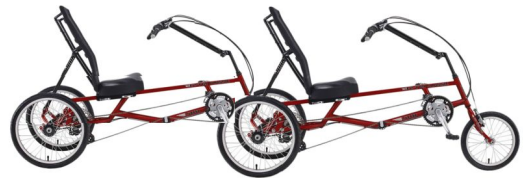
Figure 1. The proposed design of the frame of the tandem bicycle.

The frame consists of two Sun E3 recumbent tricycles connected together via a universal attachment.