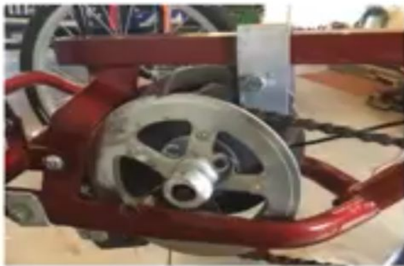
Figure 3. The final design of the resistance mechanism. The resistance mechanism from the stationary bicycle is connected to the crank of a standard bicycle and attached to the bicycle frame.

A bracket was then created by bending a 1.5 in by 60 in aluminum rod approximately 90 degrees. The bracket was attached to the bicycle frame using five \frac{3}{8} in fine-thread bolts.