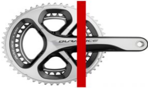
Figure 2 [4]. A typical bicycle crank, similar to the one used. The red line indicates where the crank arm was cut off.

A bracket was then created by bending a 1.5 in by 60 in aluminum rod approximately 90 degrees. The bracket was attached to the bicycle frame using five \frac{3}{8} in fine-thread bolts.