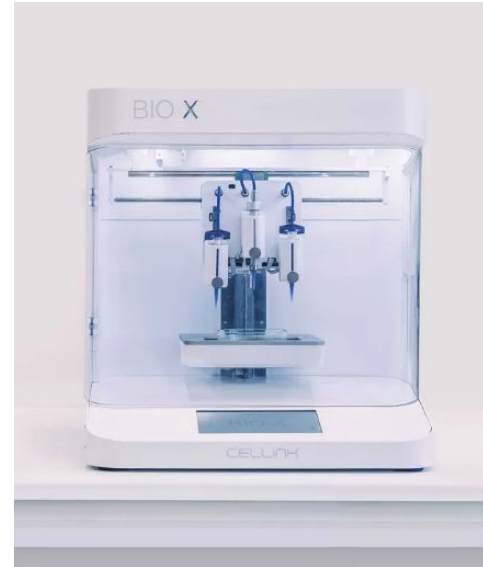
Figure 3: Cellink BioX Bioprinter [10]