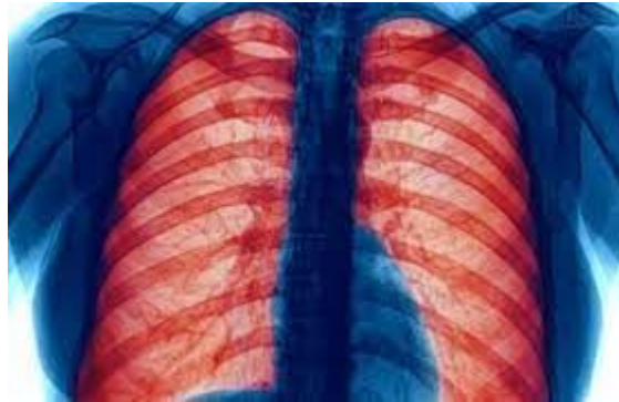
Figure 1: Graphical depiction of chronic lung diseases [1]